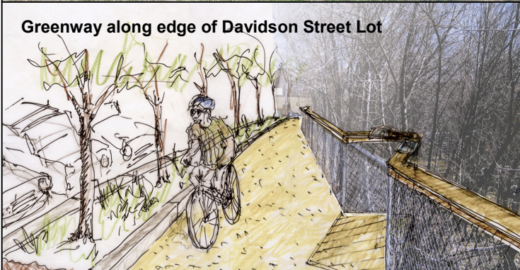
Greenway along edge of Davidson Street Lot