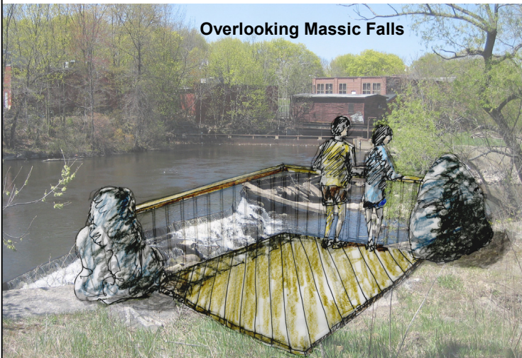
Overlooking Massic Falls

Below are two images from the recently completed Public Art Plan for the Concord River Greenway, created by the artist team of Mags Harries and Lajos Héder. This will be available on our web site and will help inform the final design of the Greenway. Funding for the Public Art Plan has been provided by the New England Foundation for the Arts' Fund for the Arts. This was the first pilot project chosen for funding outside Boston by the Fund for the Arts. Features of the plan include locations for scenic overlooks, trail design features, and aesthetic elements that "enhance people's experience of the river." We thank those of you that participated in Greenway walks and open houses to provide input to the artist team.